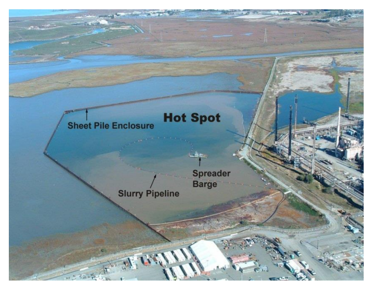
Castro Cove Remediation, November 2010